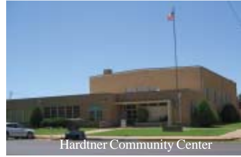
Hardtner Community Center