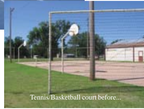
Tennis/Basketball court before...