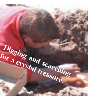
Digging and searching for a crystal treasure.

government. The trip to the capitol to make their request was a double learning encounter. They learned about each floor of their state capitol, from the history to the meaning and the significance. The process of naming the Selenite as the State Crystal didn't go without some