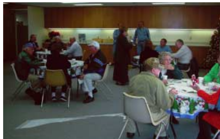
Christmas Open House 2003