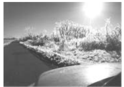
Traveling to different Central Offices.

support to our customers. We hope that you appreciate the fact that these people risked their lives to maintain your ability to call for emergency help during the time of crisis. We had several incidents, which really, disturbed me. During the power outages KanOkla had two standby generators stolen. One was at the remote site just across the Oklahoma state line, south of Kiowa, KS, the other occurred northwest of Braman, OK, at the Blackwell Lake. These generators were chained