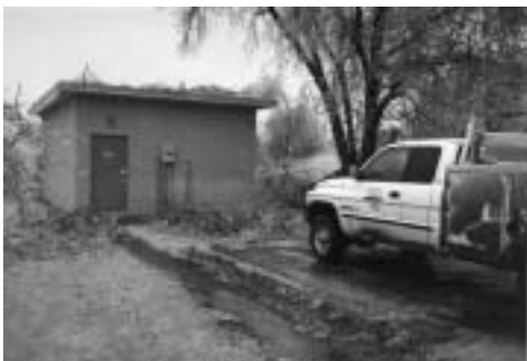
At a Central Office location