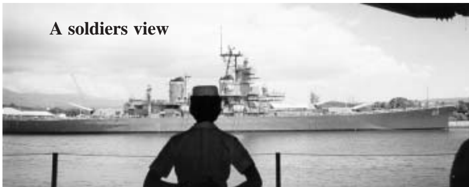
A soldiers view