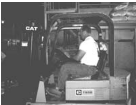
Chuck Tyler (KanOkla employee) is shown operating the forklift at Coop's feed mill.