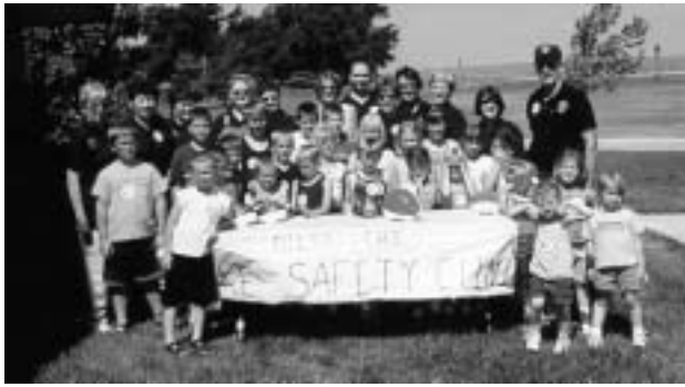
Delta Chi Sorority pictured with Caldwell Police Department and participants of the safety bike clinic.